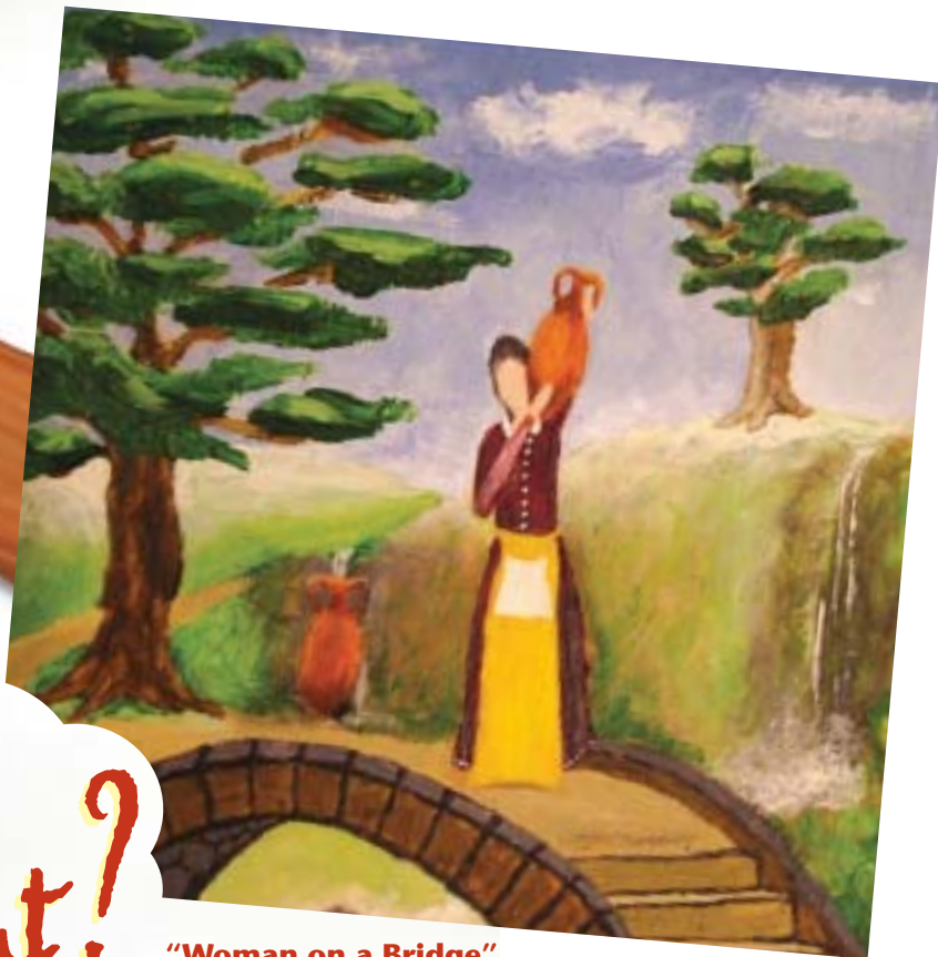
"Woman on a Bridge" by Sid Chidiac

What's your favorite thing to do with chocolate? Eat it? You might wonder, "What else would I do with it?" Some people say: "Create art with chocolate."